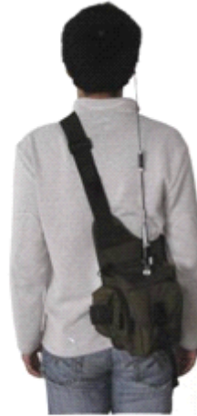
Used with the backpack

This equipment can realize the wireless transmission with high definition video and stereo audio in NLOS (Non line-of-sight) condition. The first responder can carry the equipment to enter accident ground and then the transmitter send the camera's digital, compressed signals to the commanding center.